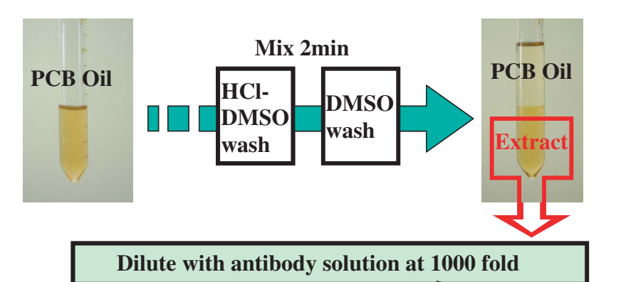
Fig.1 The extraction and measurement The PCB congener was extracted from oil by HCI-DMSO followed by neutral DMSO. The extract was diluted at 1000 fold with the anti-PCB antibody solution and the mixture was subjected to the biosensor to detect PCB. In the absence of PCB in the extract, the resultant signal on the biosensor was large. In the presence of PCB, the signal was appeared to be small.