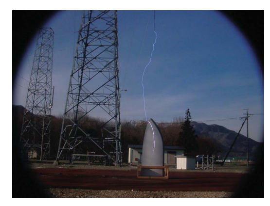
Fig.1 Large-scale thunderbolt test to a wing of wind power generator

Risk management of electric power infrastructure (natural disaster risk)