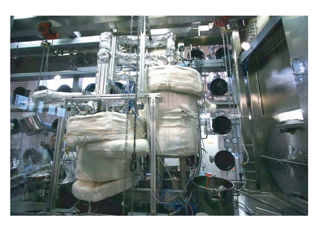
Fig.4 Molten Salt Transport test Rig.