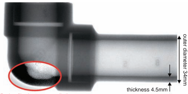
Retine filtering were applied

By assuming epoxy resin with AlN filler as insulating materials of all-solid transformers, a trial design was carried out on condition that it is almost same size as a conventional oil immersed transformer (external size: 3.7m x 2.1m x 1.3m). According to this design its weight is about 28 ton, which is about 80% compared with a conventional transformer.