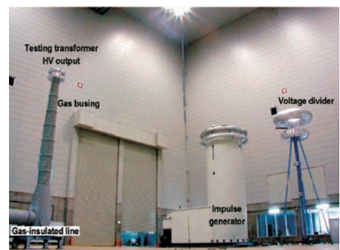
Inside of the main hall