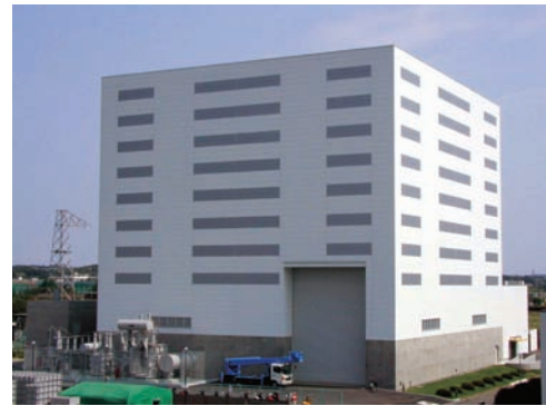
A whole view of the Laboratory