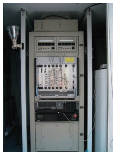
Equipment for the control of our radar system