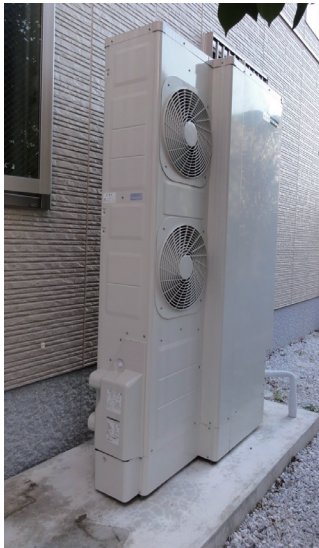
Fig. 1 Small-sized Eco-cute for field test Heating capacity (max.): 10kW Capacity of hot water tank: 185 liters Size: 0.45m × 1.1m × 1.9m Its footprint is about half of the conventional type.