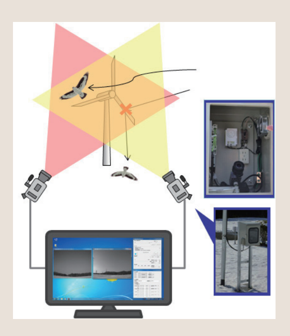
Fig. 2: Outline of the system for monitoring flying birds

The estimated distribution of important species, which should be assessed at the planning stage, can be mapped in and around the project area (left). From the published information which suggests the existence of many important species in the whole region, the list of target species for the estimated distributions of those species in the project areas is extracted. This enables efficient impact assessment of power plants at the planning stage (flowchart, right).