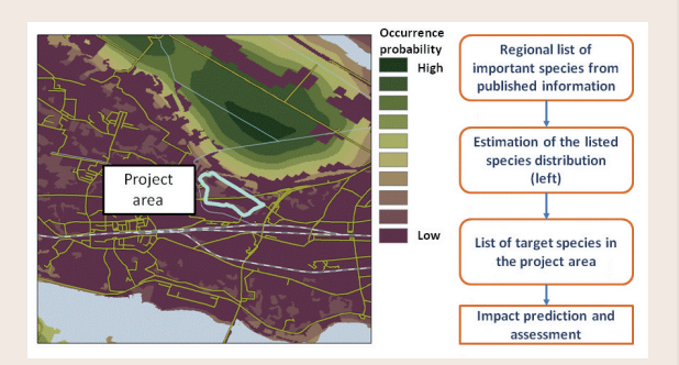
Fig. 1: Estimation of the distribution of important species at the planning stage

The estimated distribution of important species, which should be assessed at the planning stage, can be mapped in and around the project area (left). From the published information which suggests the existence of many important species in the whole region, the list of target species for the estimated distributions of those species in the project areas is extracted. This enables efficient impact assessment of power plants at the planning stage (flowchart, right).