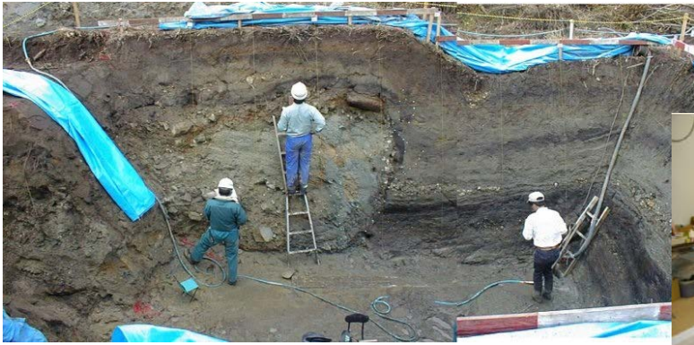
A look of investigation of active fault, and Sample analysis with X-ray computed tomography scanner